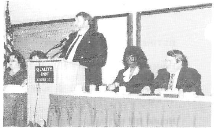
"What's Going On In the Departments"