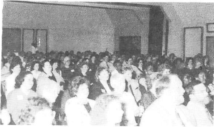
1993 State Conference - Bossier