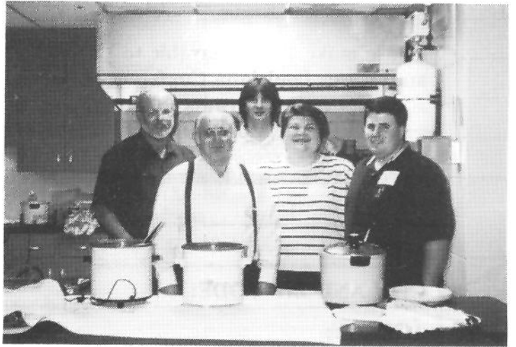
The Gourmet Chefs