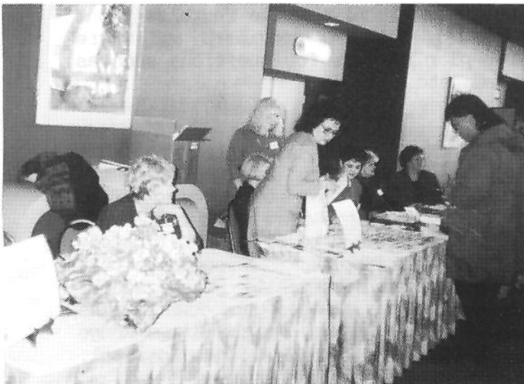
The over 300 attendees kept registration busy